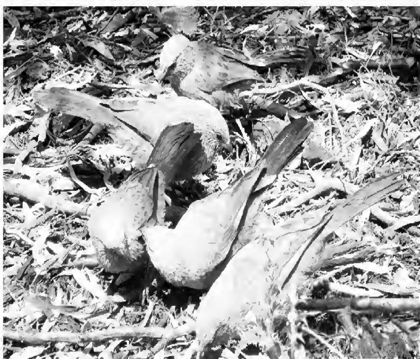
Figure 4. A flock of five apostlebirds Struthidea cinerea in Nurragingy Reserve, Doonside.

1964) demonstrate the possibility of coastal urban populations forming in Sydney. Being a mudnester, the climate of the eastern seaboard may perhaps facilitate its breeding by the continuous availability of damp soil and reliable rainfall. In addition, urban environments present fewer natural predators such as birds of prey and monitor lizards. Although domestic